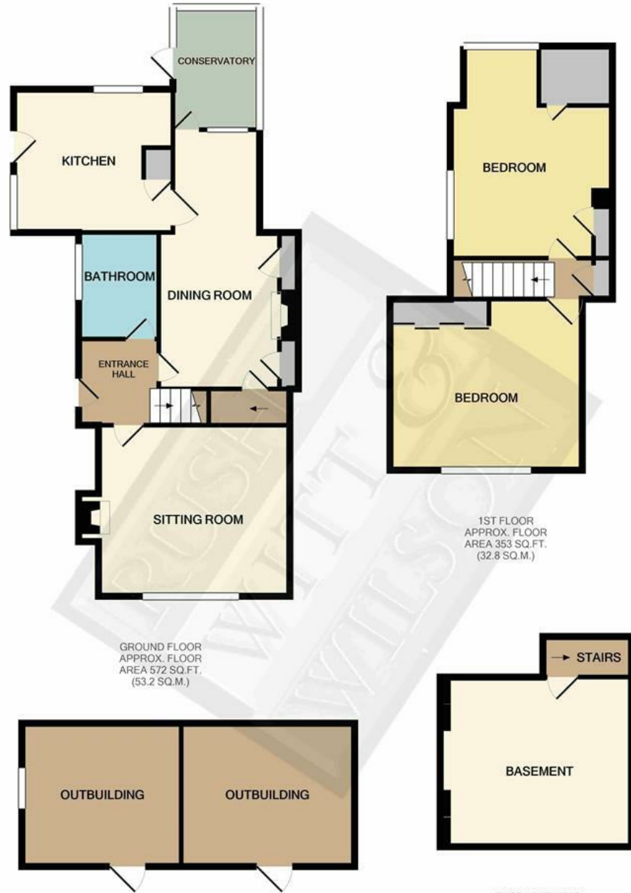
GROUND FLOOR APPROX. FLOOR AREA 572 SQ.FT. (53.2 SQ.M.)